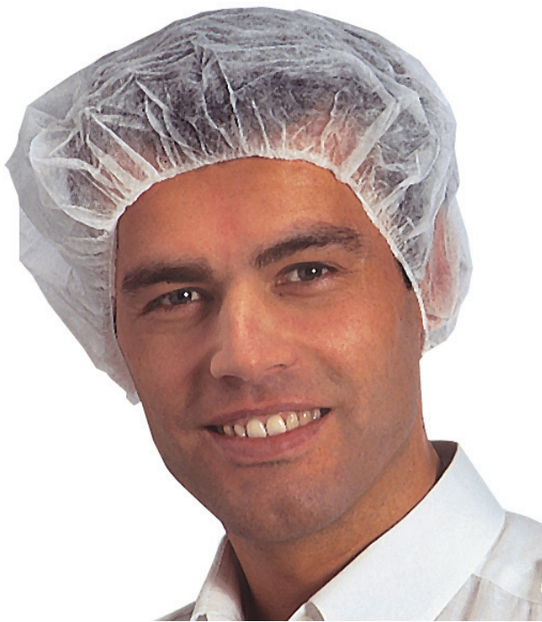
A: 53 cm (*)